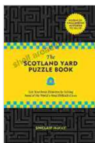
Image Alt Attributes: Detective with magnifying glass; Crime scene investigation; Puzzle grid; Scotland Yard logo