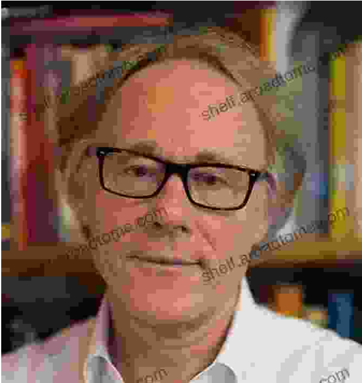
Graham Hancock, a pioneer in the exploration of ancient mysteries